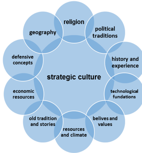
Figure1. Constructive General Factors of Strategic Culture